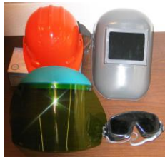
Helmets/ Face Guards